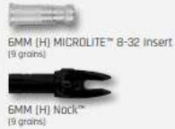
6MM (H) MICROLITE™ B-32 Insert (9 grains) 6MM (H) Nock™ (9 grains)