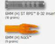
6MM (H) ST RPS™ B-32 Insert (18 grains) 6MM (H) Nock™ (9 grains)