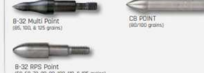
B-32 Multi Point (85, 100, & 125 grains) B-32 RPS Point (50, 60, 70, 80, 90, 100, 110, & 125 grains) CB POINT (80/180 grains)